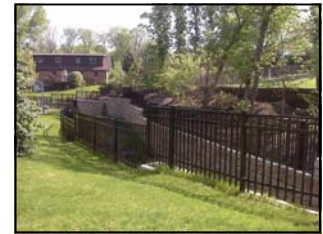
Clockwise from top: Caroline Weltzer; Margaux McGlasson; Circle Drive/Grand Ave. Storm Water Improvement Project