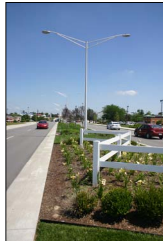
Phase I of the Mall Road Reconstruction project was completed in October 2010

The Mall Road Reconstruction project was funded by the Commonwealth of Kentucky Department of Highways and the City of Florence. The final ribbon-cutting ceremony for the entire Mall Road Reconstruction project is tentatively scheduled for mid-October. Governor Steve Beshear is scheduled to attend.