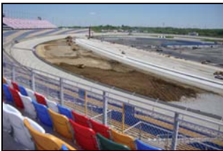
Construction wraps up at the Kentucky Speedway just in time for the July 9th Quaker State 400

-Mark Simendinger, Track Manager, Kentucky Speedway