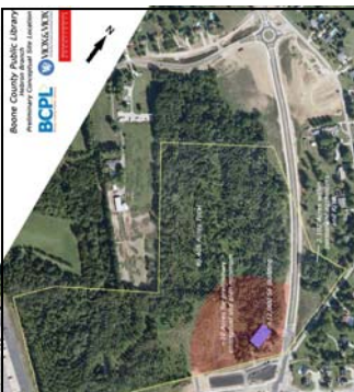
Aerial view of the new Hebron library site on KY 237

The Boone County Library Board has hired Viox & Viox to research and prepare a report on the development of the future site of a new Hebron branch. Several years ago, the Library Board purchased 51 acres of land along KY 237, near Graves Road, with the intent of building a new and larger library to service the Hebron area. The new library will require approximately 8 to 10 acres for the building and parking, leaving approximately 40 acres of surrounding land.